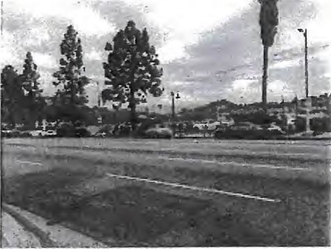
Vermont Marathon.JPG 3117K